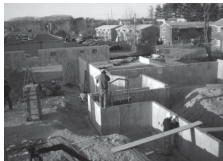
The perimeter foundation walls of our new shelter are nearly complete.