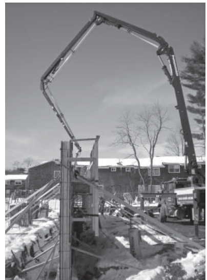
Cement is pumped into forms to create the foundation of our new facility.