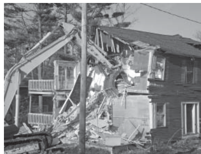
A shelter building that provided transitional housing for families was demolished in November.